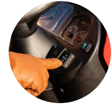
4. Cruise control