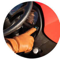
2. PTO on/off switch