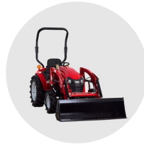
1. Optional loader with high lift capacity

Get more work done quicker with this small-frame tractor. The T265 balances maximized lift capabilities and high maneuverability to be an all-round multi-tasking machine.