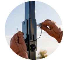
5. Foldable ROPS or heated cab