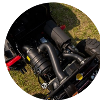
3. Dual filter air cleaner